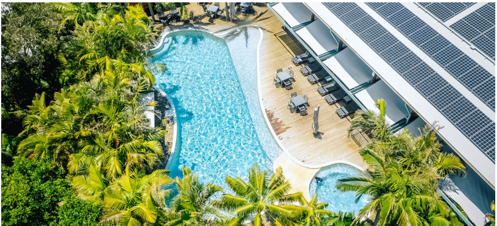
Aerial shot of Swimming pool, spa and restaurant/bar located within the resort

An annexure enclosed shows the associated costs of belonging to the Mobys Beachside Retreat leasing pool. These expenses are subtracted from any income that the beach house generates and the balance is paid to you monthly.